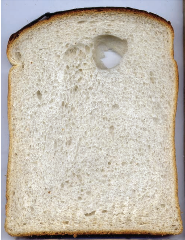
Fig. 1. Dough damage and hole formation in pan bread.

Technology has moved on since 1961 and so has our understanding of the role that protein (gluten) quality plays in bread quality. The assessment of dough rheology lies behind many of our testing methods and helps us anticipate characteristics like volume. In addition to being linked with bread volume, gluten rheology (I use the term now since I am referring to dough) plays a part in the formation of the cell structure of the baked product. There is a particular role that gluten rheology plays as the dough is processed during dividing and molding.