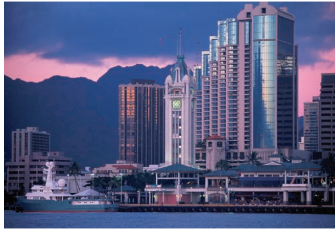
Aloha Tower Marketplace & downtown Honolulu skyline at sunset, Island of Oahu

Inform the operator that you are attending the AACC International Annual Meeting.