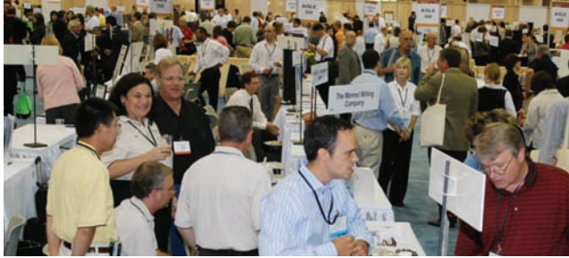
Exhibit Hall Hours

The 2008 annual meeting would not be complete without an exhibition of the latest products and services that advance the work of the industry. Technical sessions do not take place during exhibit hours to allow ample time for expanding your knowledge with exhibitors, peers, and technical posters.