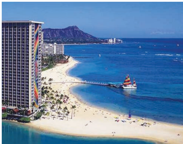
Hilton Hawaiian Village

AACC International has secured three hotels to accommodate delegates attending the 2008 annual meeting. Negotiated average rates offer hotel accommodations equal to or less than hotel rates at the 2005 annual meeting.