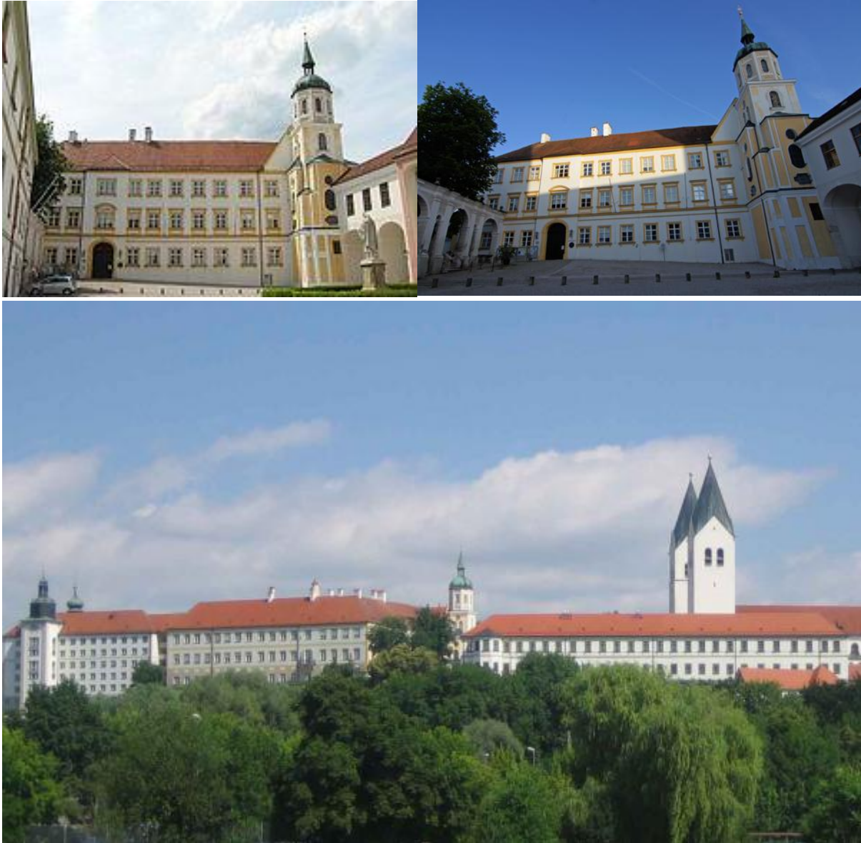
Figure 3: Kardinal-Döpfner-Haus