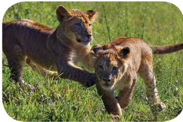
Torrey Pines Beach Looking North by Lisa Field and Balboa Park Birds Eye View by Joanne DiBona courtesy SanDiego.org; Believe Shamu and Orca Whale Show courtesy SeaWorld.org; Lion Cubs courtesy the San Diego Zoo.